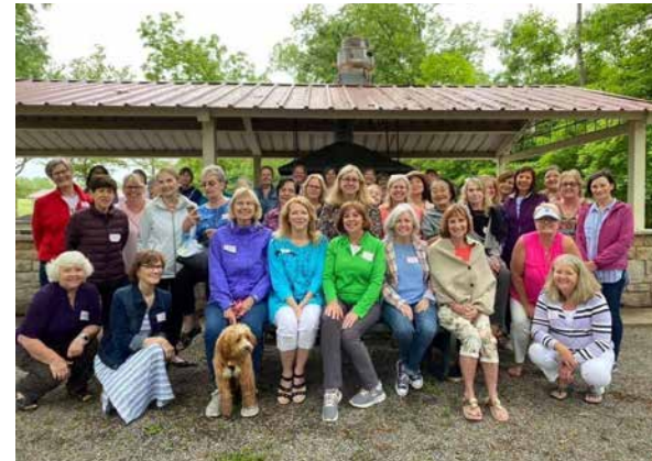
The YWCA Princeton Area Newcomers & Friends gathered in June for the End-of-Year Picnic to celebrate the end of a challenging year and welcome new Board leaders.