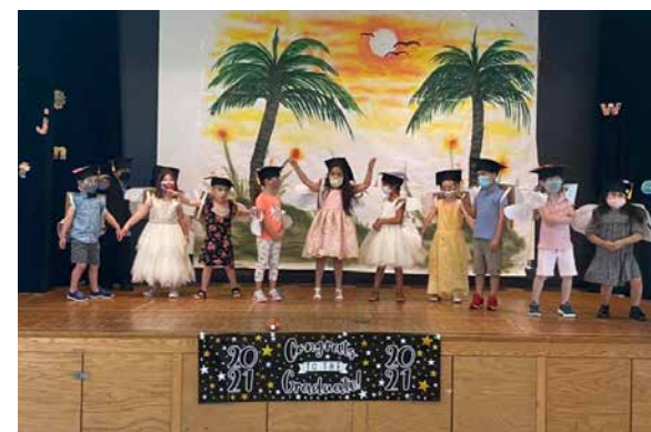
Above: The Sunflower class singing and celebrating during their graduation ceremony.

We’re proud of the impact our program has on the children, families, and staff at The Burke Foundation Early Childhood Center at YWCA Princeton.