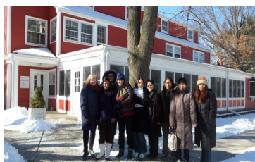
Classes are held at the YWCA Princeton's Bramwell House.

The ESL Program offers a curriculum to meet the needs of all adult English language learners from beginners to advanced students seeking work readiness skills and courses to prepare them for post-secondary education. In addition to classes, students are matched with tutors, can opt for free conversation classes conducted by qualified community volunteers, and participate in trips to museums, area attractions and community organizations.