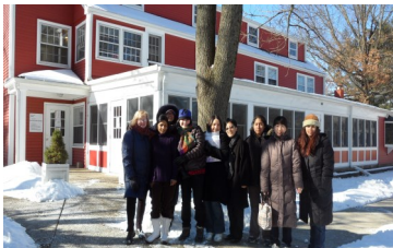
Classes are held at the YWCA Princeton's Bramwell House.

The ESL Program offers a curriculum to meet the needs of all adult English language learners from beginners to advanced students seeking work readiness skills and courses to prepare them for post-secondary education. In addition to classes, students are matched with tutors, can opt for free conversation classes conducted by qualified community volunteers, and participate in trips to museums, area attractions and community organizations.